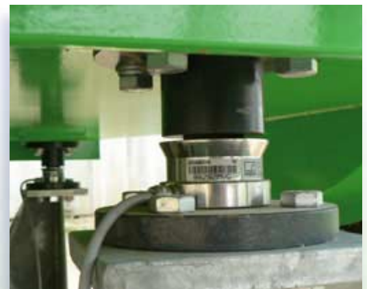
Figs. 2 and 3: RTN load cells with loading foot (above) connected in parallel via junction boxes (below)