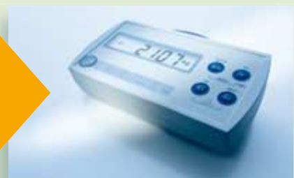
Fig. 6: Ring-torsion load cells (RTN), junction boxes and the WE2107 weighing indicator for controlling the automatic loader