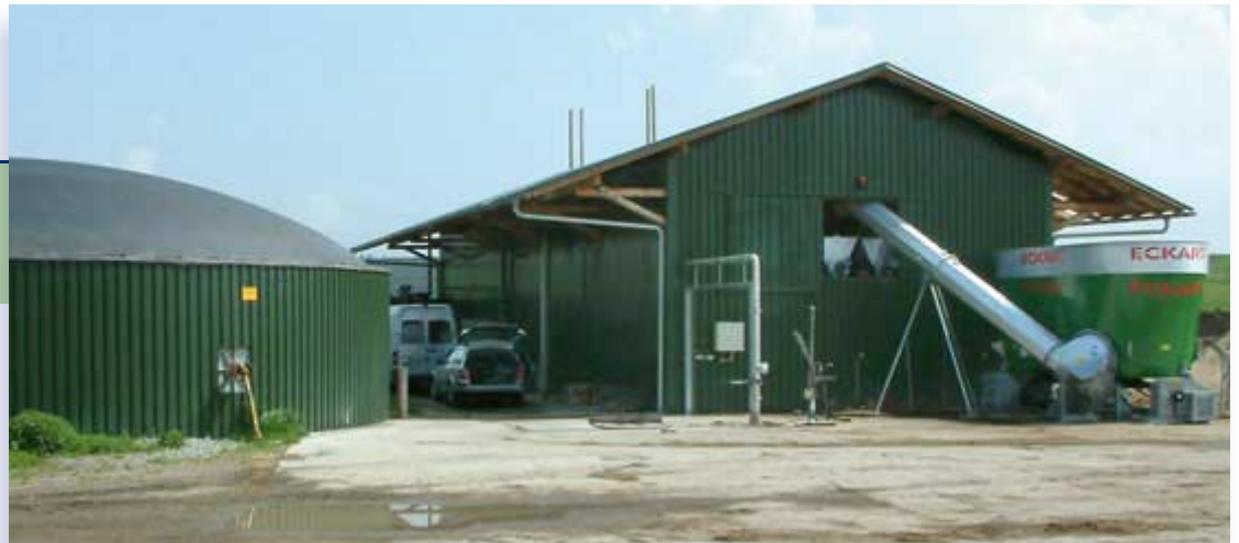
Fig. 4: Biogas installation in Southern Germany