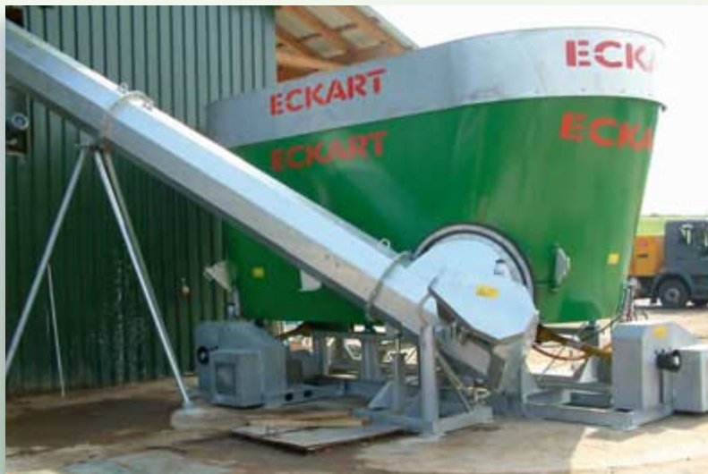
Fig. 1: Substrate store with feeding system (worm-type conveyor)