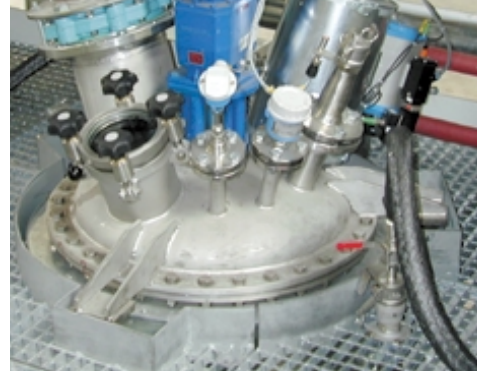
120 kg reactor tank on HLC load cells with Easy top elastomer bearings

The liquid components included in the recipe are batched into the 250 liter feedstock tanks and emptied into the mixer tank. At the manual filling section, small