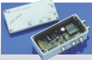
HBM's AED 9301 analysis electronics