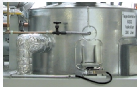
300 liter open tank on HLC load cells with Easy top elastomer bearings