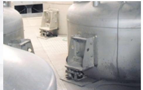
10 t mixer tank on RTN load cells with MLAR tank weighing module