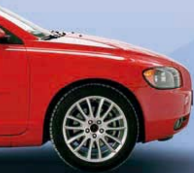
Fig. 5: Volvo C70 Cabriolet with the roof in motion