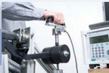
Fig.1-3: Measurement setup on the component test bench for the hardtop