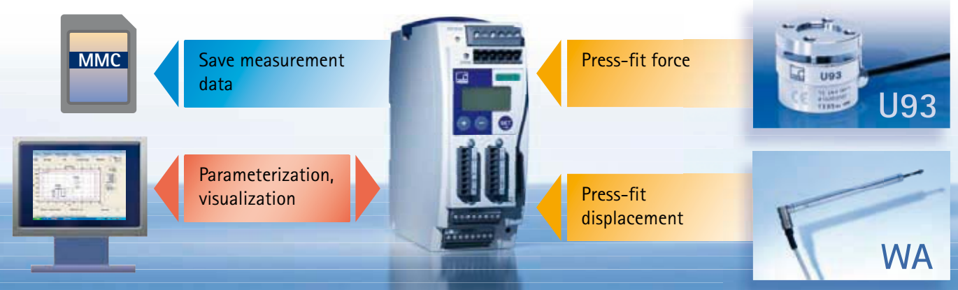
Fig. 2: Data flow with MP85A FASTpress

Contact address: Stéphane Lona, e-mail: contact@emapresses.com.