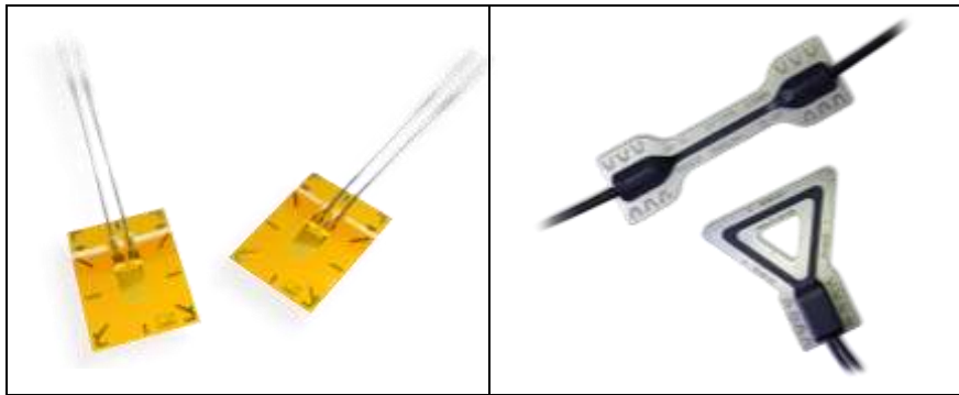
Strain gauges from HBM