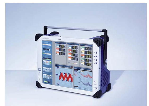
Gen3i data recorder

The system HBM configured for Sensata's shortcircuit test lab has three main components. The first of these is an HBM Genesis GEN3i three-slot data recorder, located in the lab's control room. Two GN401 optically isolated receiver cards housed in two of the slots are linked to eight external digitizertransmitters via fiber-optic cable. An intuitive touchscreen user interface allows the operator to easily control the built-in PC. The system is