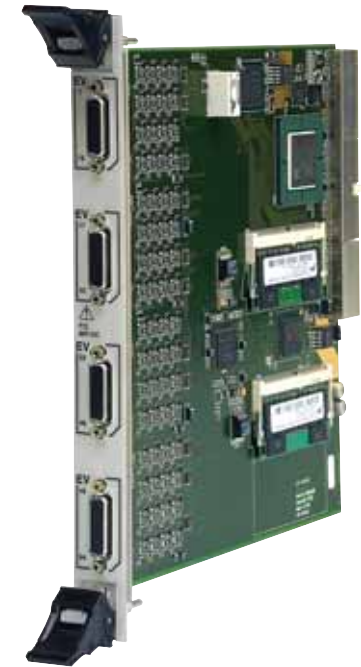
The Binary Marker CT board is cost effective and provides a variety of functionality.

Modes trigger, qualifier, alarm Trigger modes: off, rising edge active, falling edge active combination: each event trigger is OR-ed with all other trigger sources Qualifier modes: off, active high/low combination: each event qualifier is AND-ed with all other qualifier sources Alarm modes: off, active high, active low