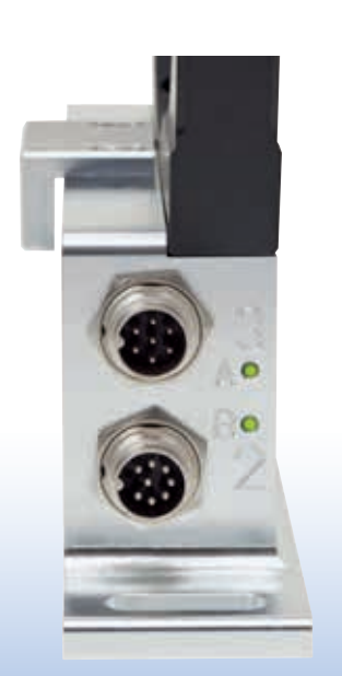
Side view of T40 stator

All T40 series transducers have the integrated digital communication interface TMC (Torque Measurement Communication) as a standard feature. The TIM Torque Interface Module extends capabilities of the torque flange in a flash, adding modern Ethernet-based fieldbuses with digital interfaces. For example, the high-performance TIM-EC EtherCAT module is available. See for yourself!